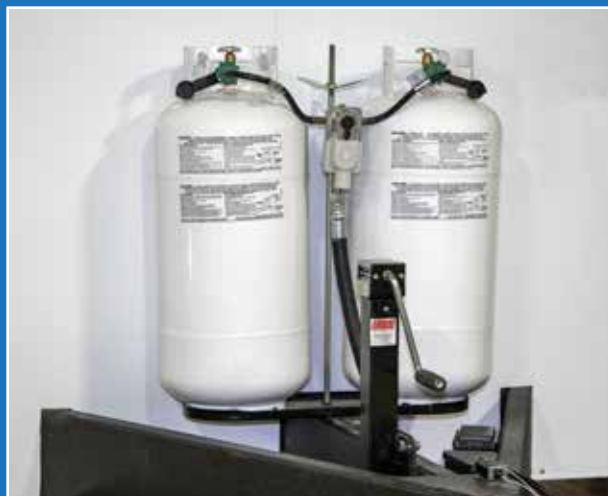
OPTIONAL Dual 40 lb. Propane Tanks