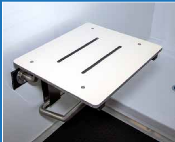
Sturdy Fold-Down Shower Bench