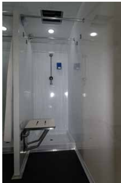
Shower Stall with Fold-Down Bench