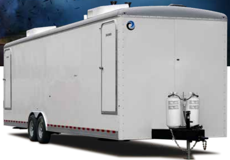
Trailer shown features optional dual 40 lb. propane on-demand tanks.