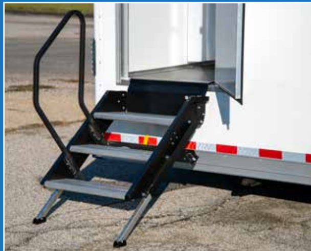
Convenient Fold-Down Step with Handrail